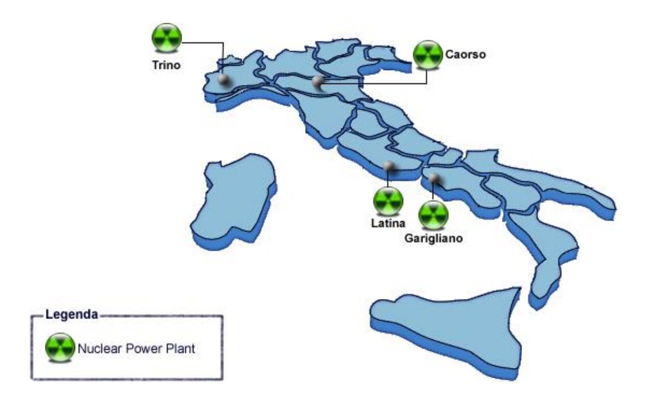
Figure 1: Location of Italian NPPs